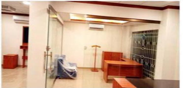
1. Faysal Bank Ltd Ganju Takkar Branch.