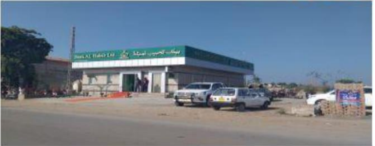
Bank Al Habib Ajnala Road Branch Punjab