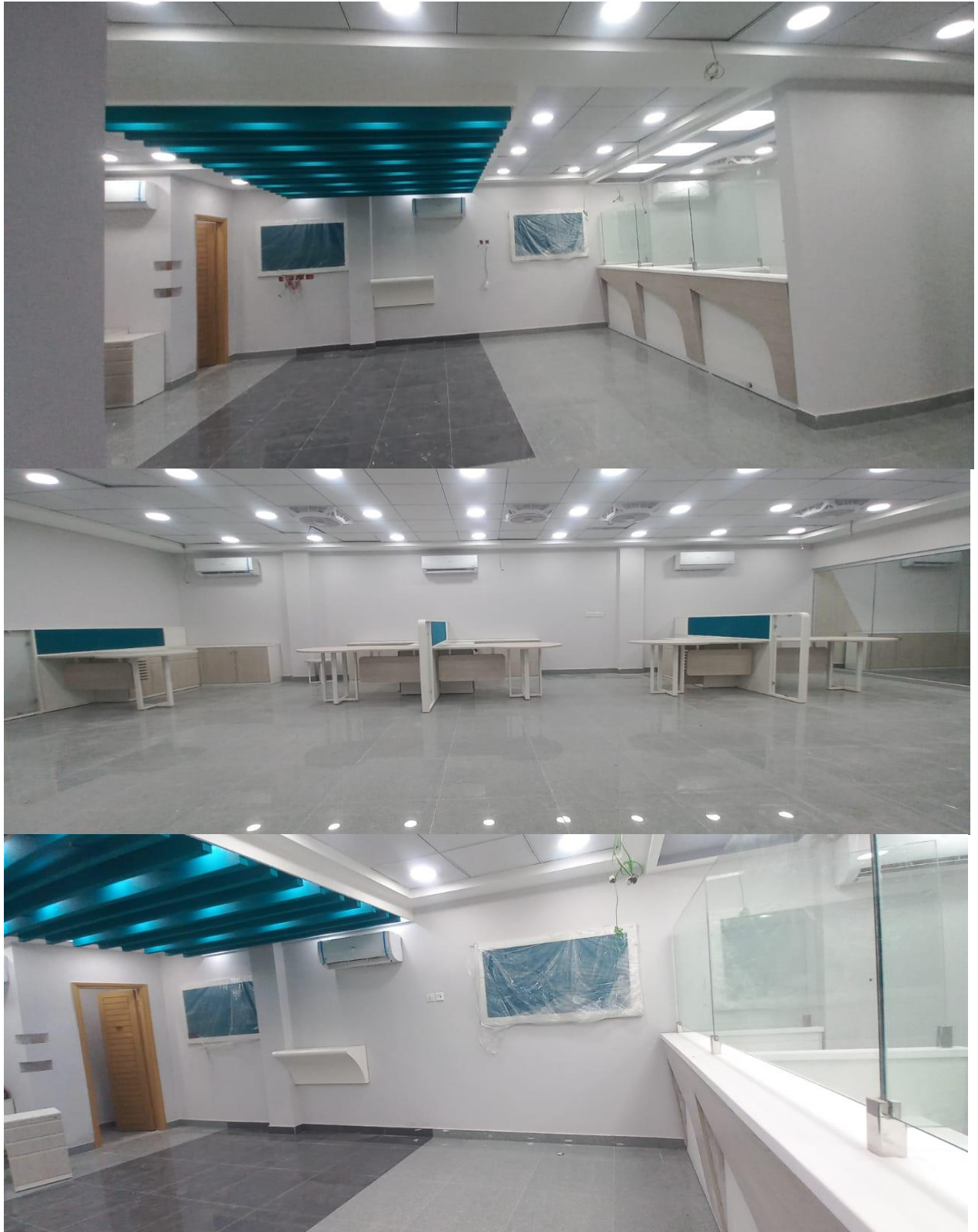
Bank Alfalah IBG Attowala Branch Kharian Gujrat Punjab

Head Office: Plot # 34 Street 36 Sector F, Manzoor Colony Karachi.